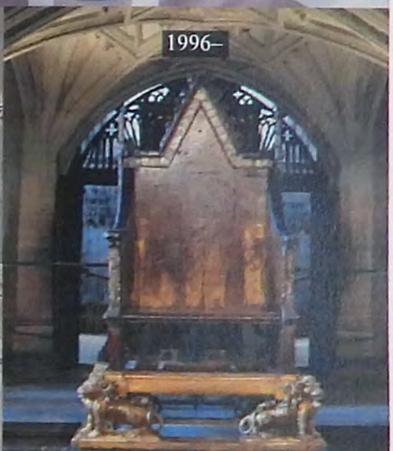
King Edward's Chair, Westminster Abbey.